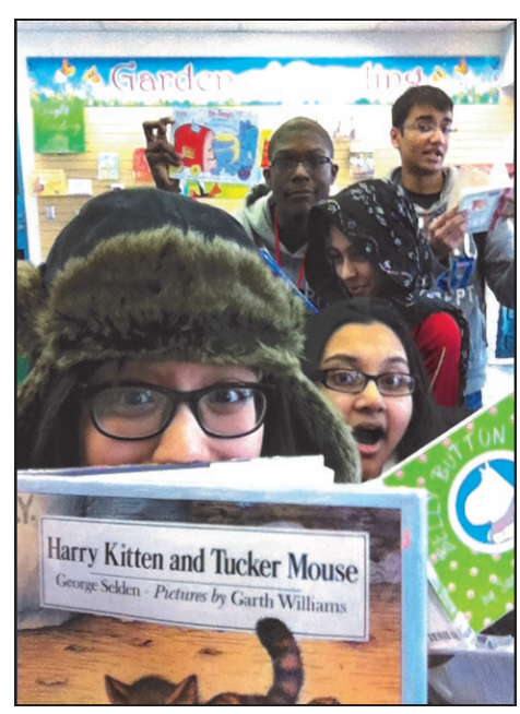
The Atlantic City Free Public Library's Summer Reading Program will include great books and programs for children of all ages and teenagers.