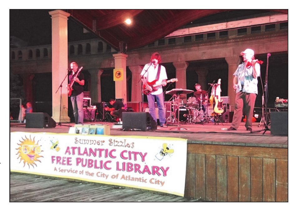
The Barley Boys, who play original, traditional and contemporary Irish music, are scheduled to perform at the Atlantic City Library International Night Series on Aug. 14. The group dazzled the crowd at last year's series.

Please check the July/August issue of Discovery or visit www.acfpl.org in coming weeks for the complete schedule.