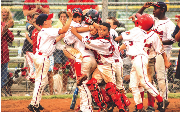
Photos that capture the spirit of American sports and showcase the athlete experience will be among those displayed. Examples of potential exhibit photos include these shots of the Grambling State University band performing during a football game and a Texas Little League team relishing a big win.