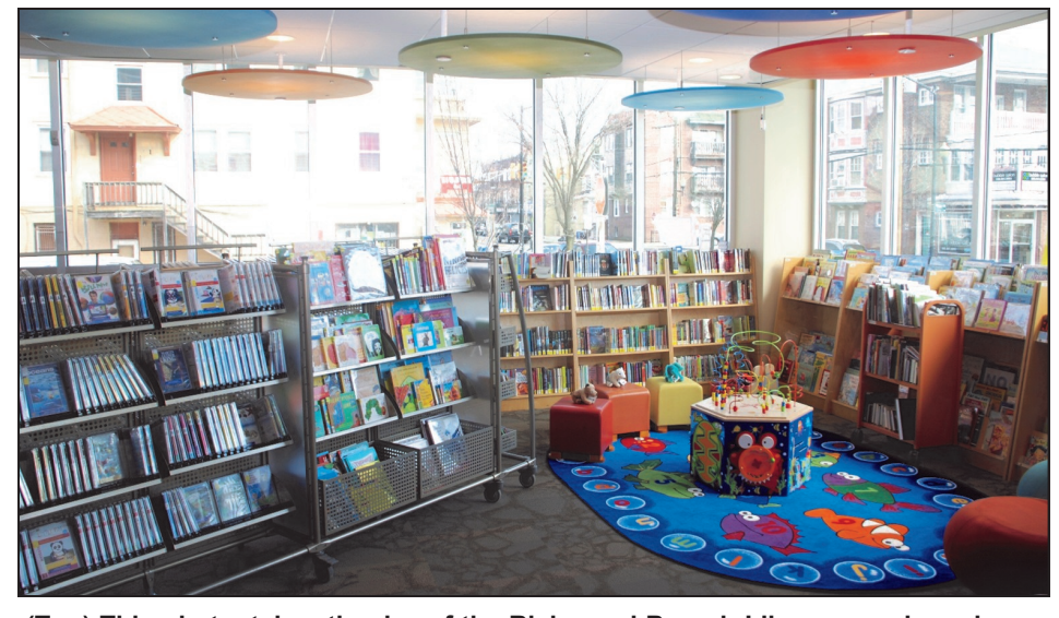
(Top) This photo, taken the day of the Richmond Branch Library opening, shows public computers and books for adults. (Bottom) There is also a fun children's area.